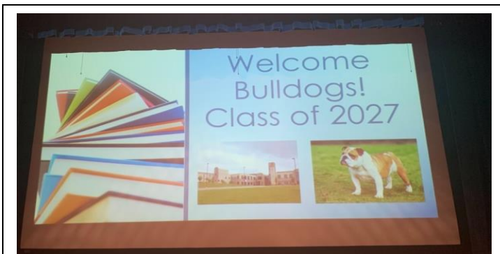
7 th Grade Orientation

In addition, we ask that parents please closely monitor your child(ren)'s health and wellness on a daily basis and keep your child(ren) home if they show possible symptoms of COVID-19. Detailed information related to COVID-19 symptoms and protocols can be found on our website at https://www.swcsd.org/